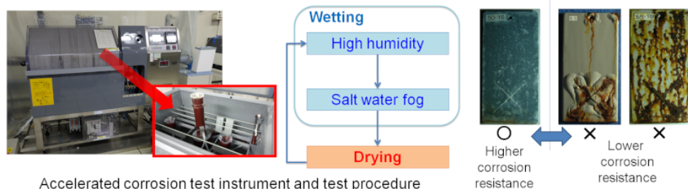
Accelerated corrosion test instrument and test procedure